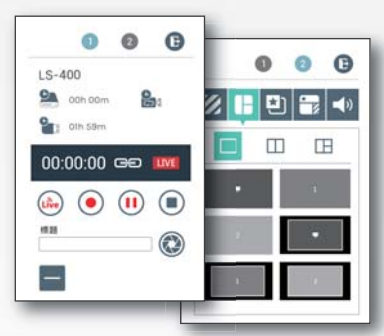
On-screen GUI & USB Interface*